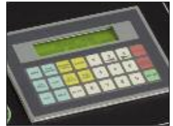
Color Coded Touch Screen