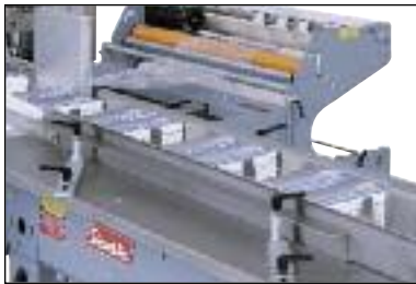
Adjustable Flight Lug Infeed

By selecting just the right combination of options, you can customize your Shanklin A-Series Automatic L-Sealer for the ultimate performance, efficiency and value!