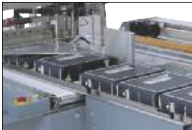
Product Spacing Infeed Conveyor