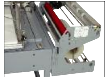
EZ Load Film Unwind