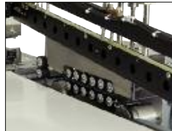
Automatic Film Puller