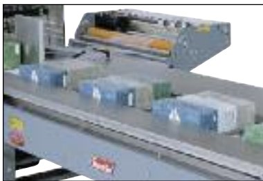
Adjustable Flight Bar Infeed