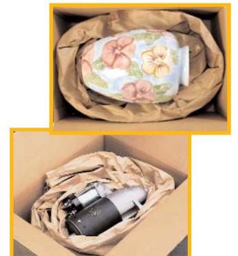
To package and protect most products