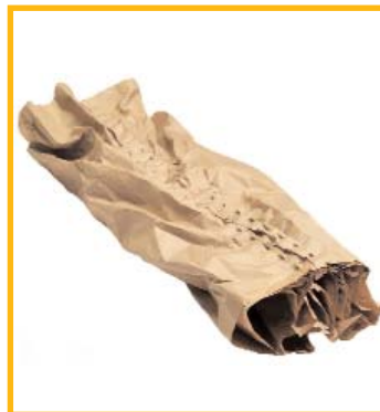
Generate cushioning pads