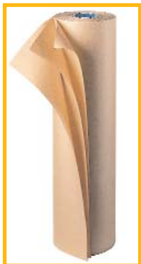
Rolls of multi-ply kraft paper