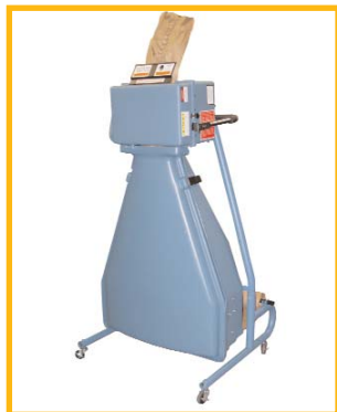
Run through patented converters