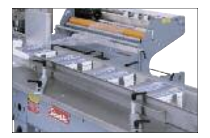
Adjustable Flight Lug Infeed