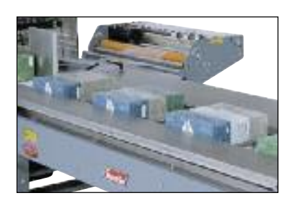
Adjustable Flight Bar Infeed

By selecting just the right combination of options, you can customize your Shanklin A-Series Automatic L-Sealer for the ultimate performance, efficiency and value!