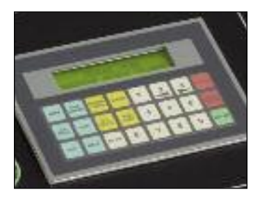
Color Coded Touch Screen