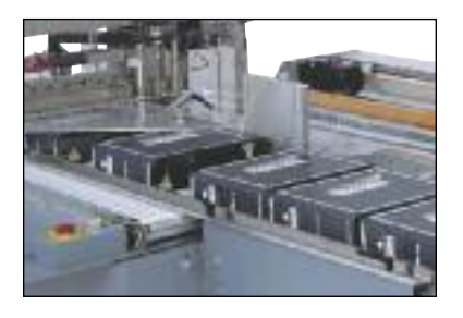
Product Spacing Infeed Conveyor