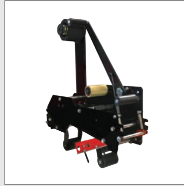
Spare Tape Head