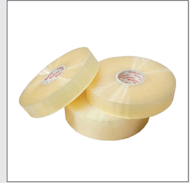
Carton Sealing Tape