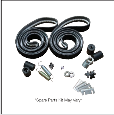
*Spare Parts Kit May Vary*