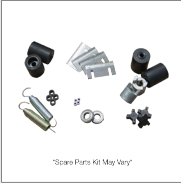
Spare Parts Kit