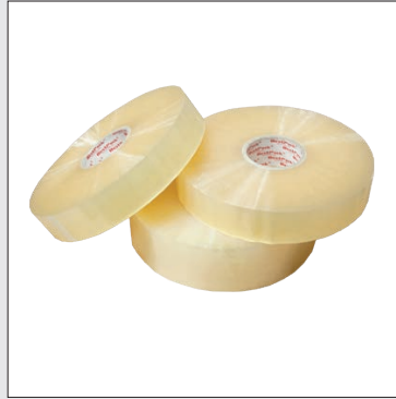
Carton Sealing Tape