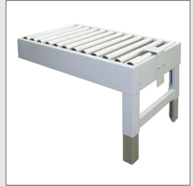
Long Exit Conveyor w/ L-Bracket