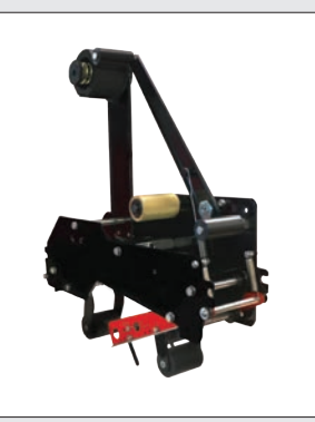
Spare Tape Head