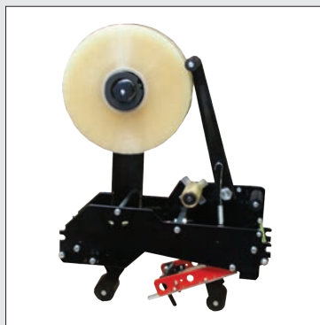
Spare Tape Head