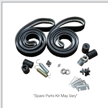
*Spare Parts Kit May Vary*