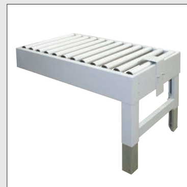
Long Exit Conveyor