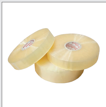
Carton Sealing Tape