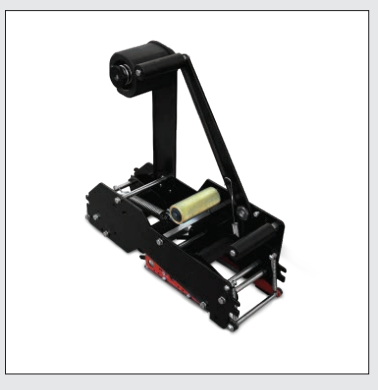
Spare Parts Kit