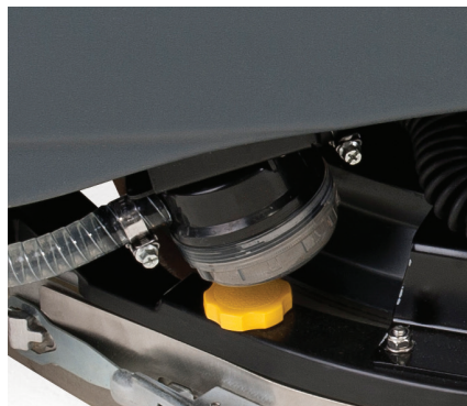
Externally mounted solution filter allows operators to easily clean the filter and manage the solution level.