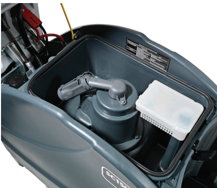
Flip-up lid and tilt-back tank provides easy access to the recovery tank, debris catch cage, batteries and EcoFlex™ cartridge.

Schools and Universities Entertainment Arenas Hospitals and Healthcare Facilities Grocery Stores Office Buildings Retail Outlets Sports Centers