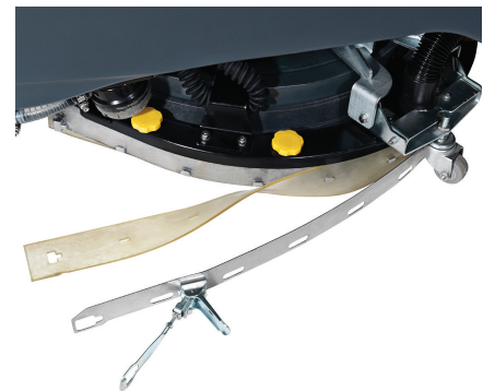
Squeegee wraps around the deck for 100% water pick-up and simply clips onto the bracket with no thumb nuts or adjustment required.