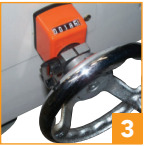
3 Analog counters simplify changeover