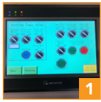
1 Automatic and Manual mode operation with failure diagnostic LED readout