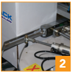
2 Pneumatic arm squares cases before sealing