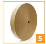
5 Large tape rolls up to 4,500'