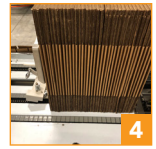
4 48" powered hopper holds up to 150 cases