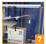
Standard interlocking safety shields (operator side)