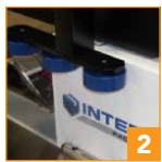
3-wheel top squeezer