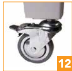
Optional swivel & locking casters