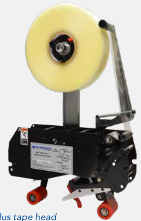
ET 2Plus tape head

When you compare features, benefits and value, Interpack™ Case Sealers are the right choice for operators, plant engineers, maintenance and purchasing.