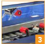
Offset tape heads process cases as low as 3.5"