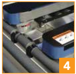
Twin 1/3 HP gear motors to process up to 85 lb cases