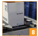
Standard indexing gate