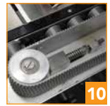
Self-tensioning & self-tracking drive belts simplify belt replacement