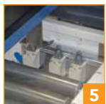
No case length adjustment necessary