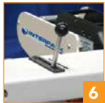
Single handle locks upper head to both columns