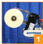
Tip-up top tape head eases roll replacement