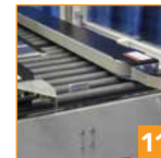
Side belt drive secures the case during processing