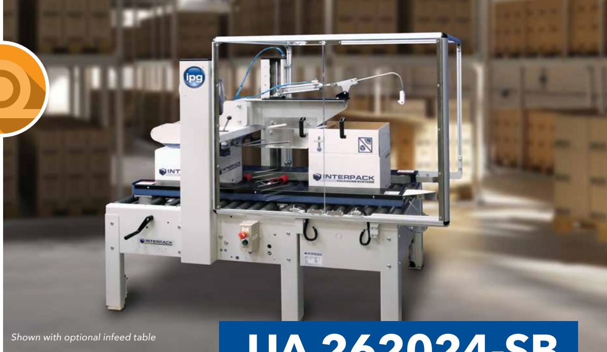
Shown with optional infeed table