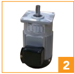
2 One 1/2 HP motor & one 1/4 HP motor