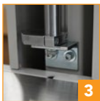
3 Selectable minimum height