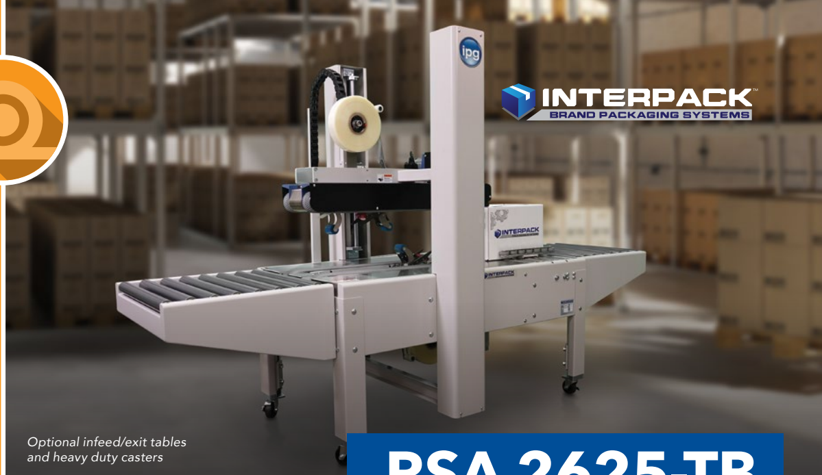
Optional infeed/exit tables and heavy duty casters