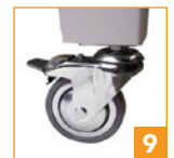
9 Optional swivel & locking casters