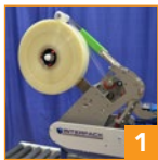
1 Tip-up tape head simplifies roll replacement