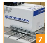
7 Horizontal centering guides with rollers