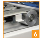
6 Self-tensioning & tracking drive belts simplify belt replacement