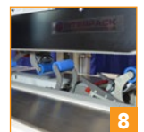
8 Offset tape heads process 2" high cases