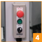
4 "Blocked" button for jams & replacing bottom tape roll