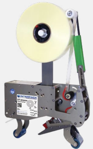
ET Xtreme™ Tape Head

Featured with the newly designed Interpack RSA case sealer is the next generation ET Xtreme™ tape head housing patented technology that safely provides optimal tape application and wipe down - even on recycled corrugate. Superior wipe down on each of the three taped panels is achieved with innovative design while minimizing force, thus, virtually eliminating crushed or damaged cases. When you compare features, benefits and value, Interpack Case Sealers are the right choice for your demanding job.