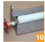
10 Adhesive activation with patented roller technology