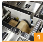
1 Easy tape threading