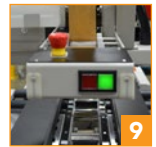
9 Color coded indicator assures proper spacing between cases