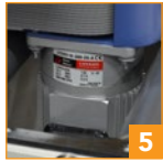
5 Powerful twin 1/3 HP gear motors