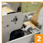
2 Powered tape unwind