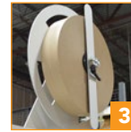
3 Large tape rolls up to 4,500'