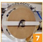
7 Easy tape roll replacement