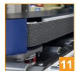
11 Premium side belt drive