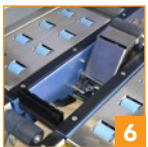
6 Double wipe-down of tape legs and center seam