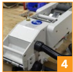
4 Easily removable tape head