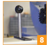
8 Slide & lock upper head adjustment