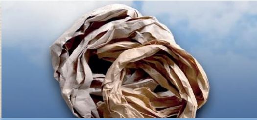
Simple and reliable