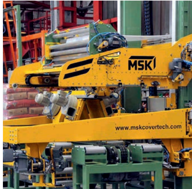
Lowerable machine head

The film hood can be stretched individually for all pallet/product sizes to any longitudinal and transversal coordinates. This enables the use of thinner film and the packaging of various pallet and container sizes. The patented MSK Vertical stretch thereby increases the load stability. The products are protected on five sides against moisture and dirt and are perfectly visible at the same time.