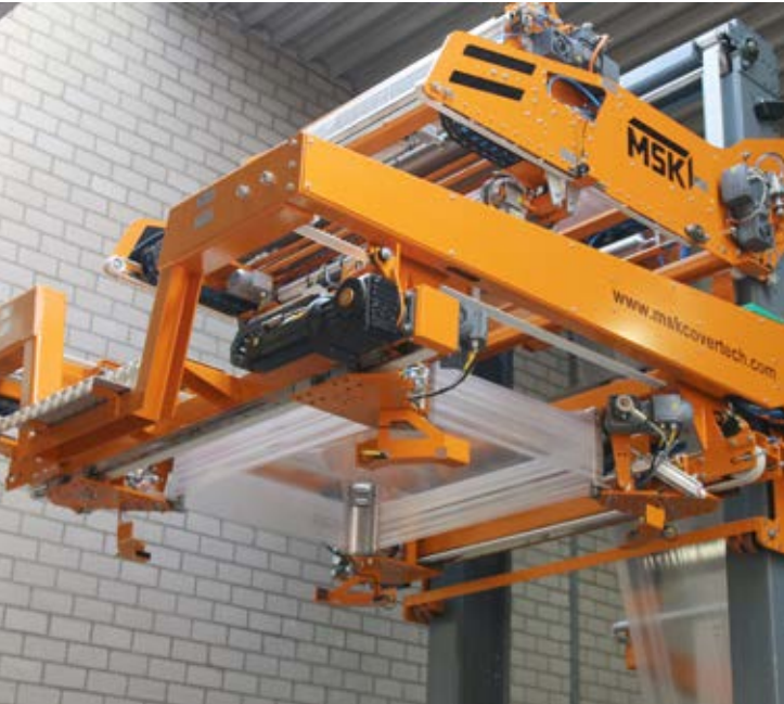
MSK stretch system

The film hood can be stretched individually for all pallet/product sizes to any longitudinal and transversal coordinates. This enables the use of thinner film and the packaging of various pallet and container sizes. The patented MSK Vertical stretch thereby increases the load stability. The products are protected on five sides against moisture and dirt and are perfectly visible at the same time.