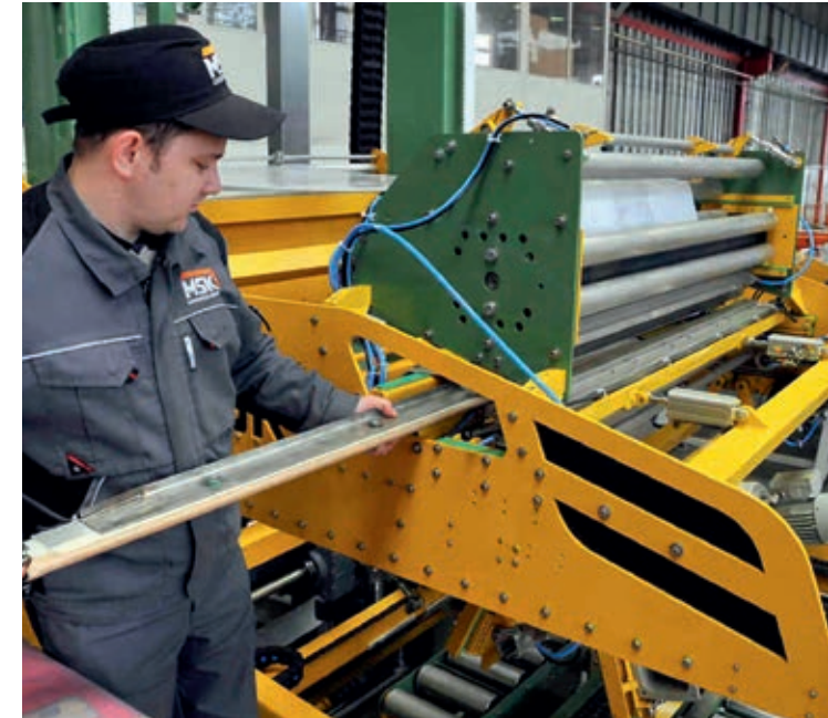
Easy exchange of film rolls and welding bar

The machine head can be lowered to ground level. Maintenance of the machine head becomes easier and faster in this way.