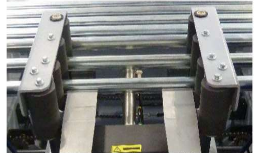
Motorized side guide rollers with idle conveyor rollers for 0.25" base

The Compacta SPR features idle roller infeed and outfeed with motorized side guides. Conveyors and guides are designed to handle heavier products on thicker packaging materials.